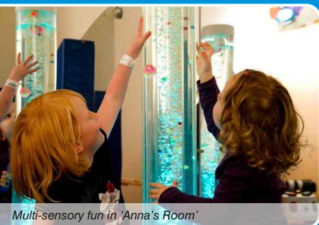
Multi-sensory fun in 'Anna's Room'

“Children who regularly have to be here have a much better experience. It makes a massive difference to have a bed next to my child on the Ward. A huge thank you to everyone who supports the Stars Appeal”