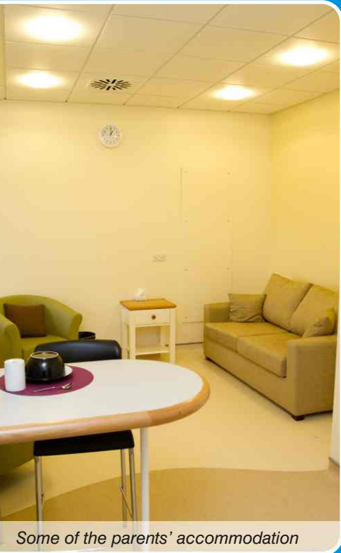
Some of the parents' accommodation