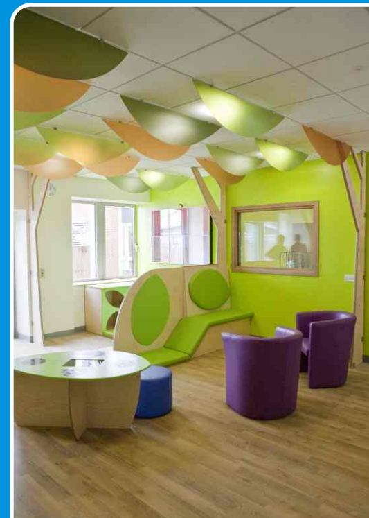
The treetops themed ward